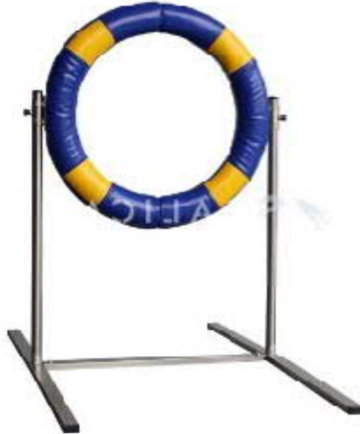
Figure A1: Saloon Door Style Tire